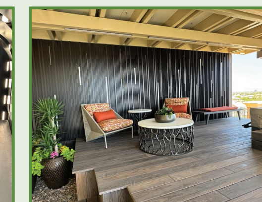
European manufacturer of innovative smart shade structures featuring motorized operable louvers, LED lighting, zip shades, and rain sensors